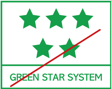
Do not change the proportions