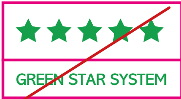
Do not change the outline colour