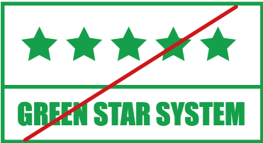
Do not change the typeface