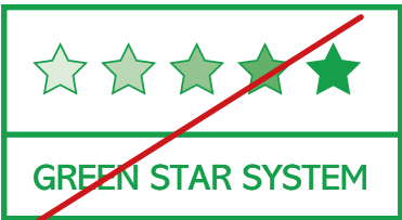
Do not change the stars' colour